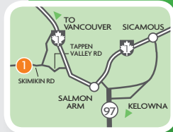
MAP A. SALMON ARM