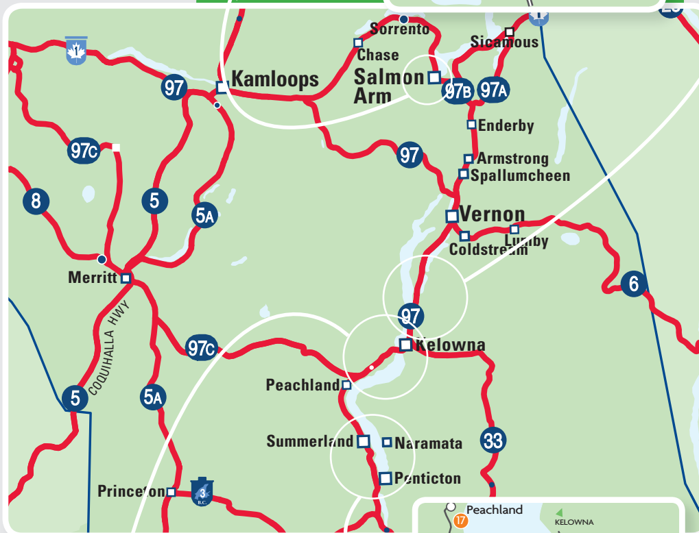
MAP C. KELOWNA